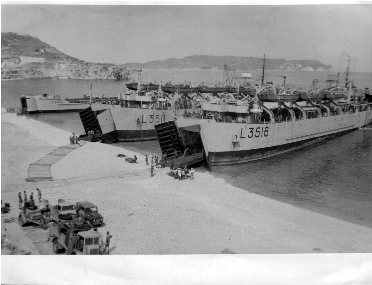
HMS STRIKER and other ships of the AW Squadron doing an amphibious landing in Mellehia Bay, Malta