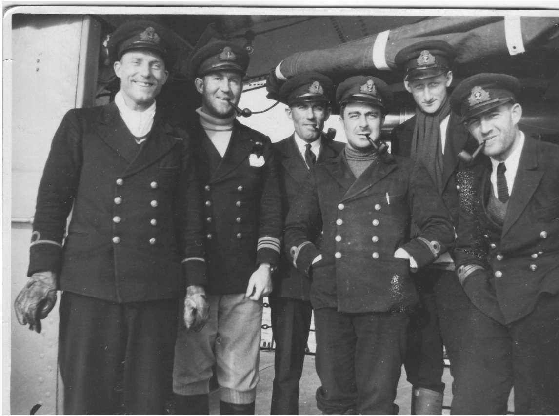
HMS VEGA Officers

In Jan 33, he was assessed as "Sat, below average, keen somewhat slow, loyal, tactful, cheerful" by Lt Cdr Black, presumably the CO.