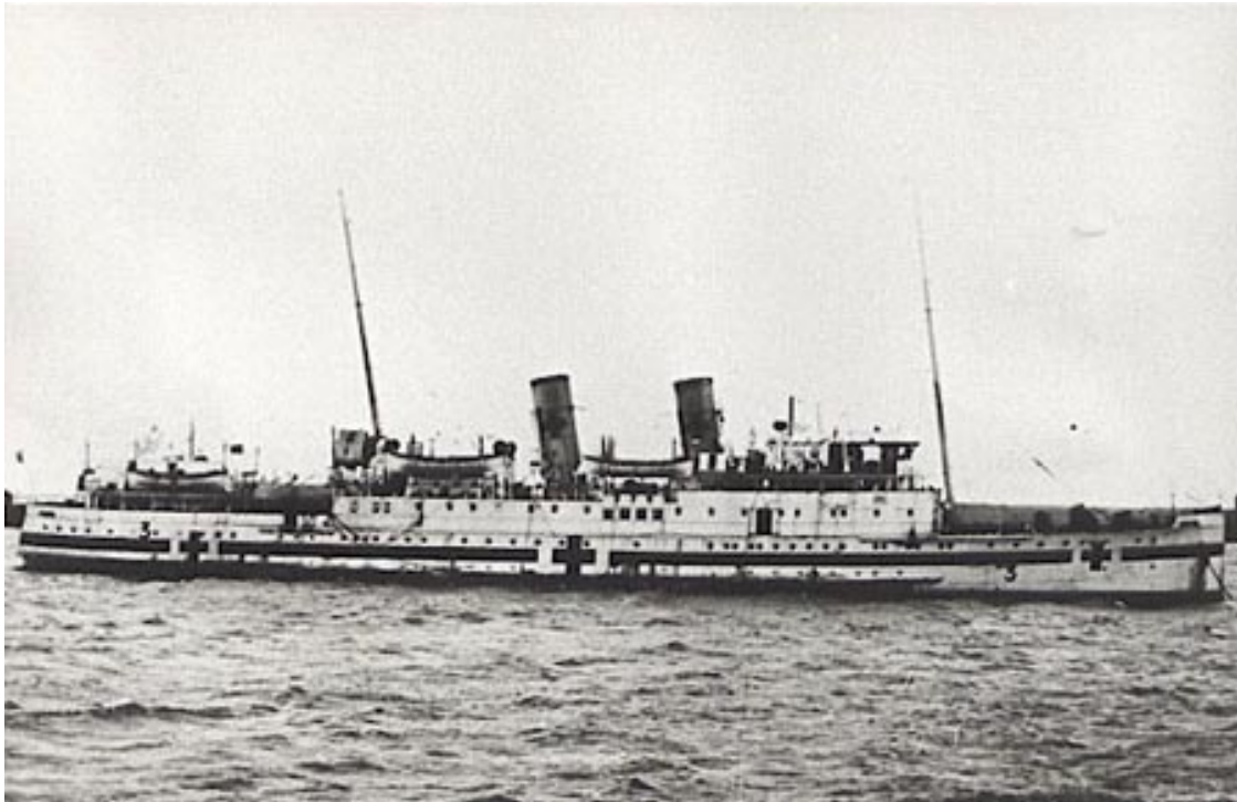
Hospital Ship ISLE OF JERSEY