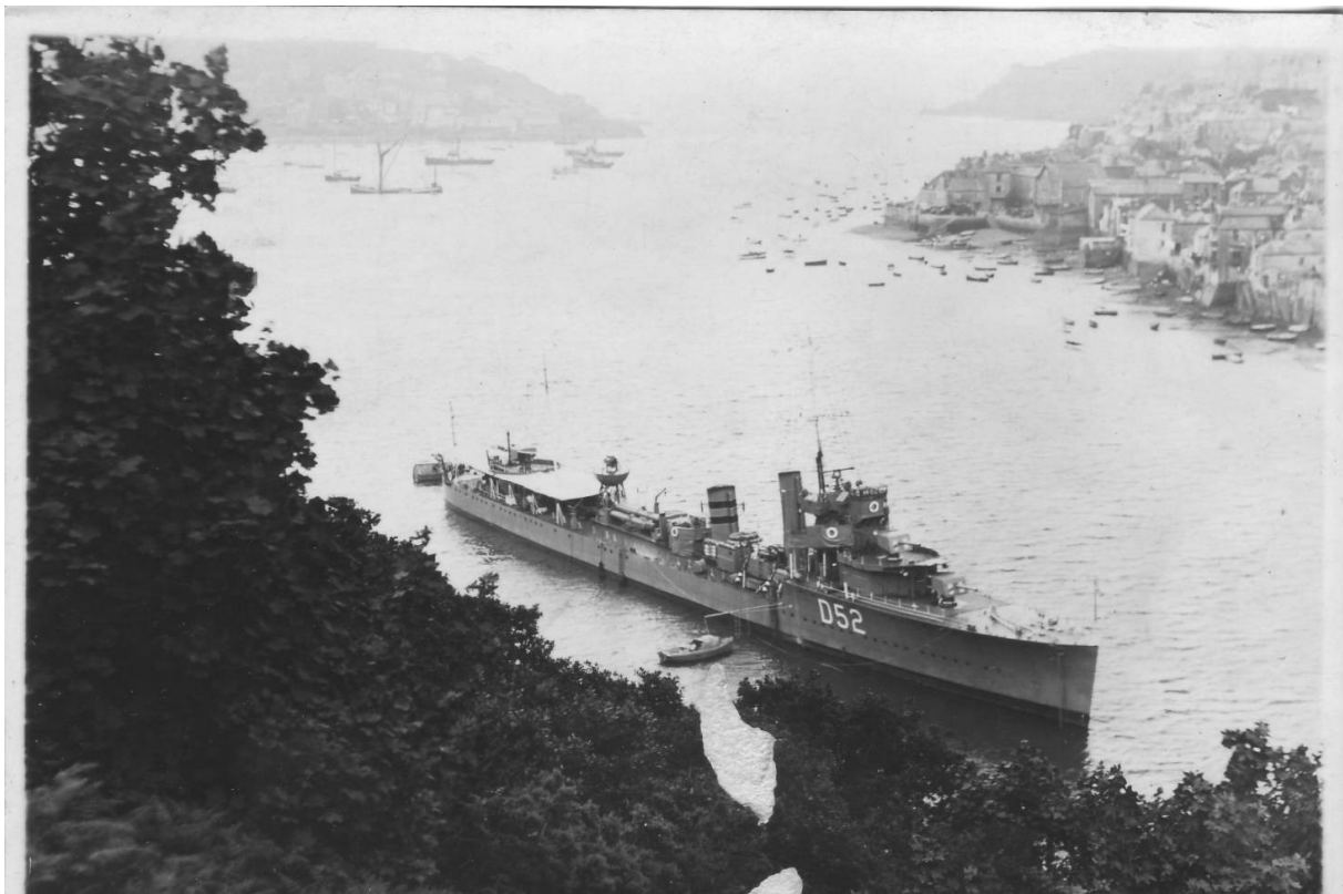
HMS VEGA – in Fowey

On 12 April 1932 he was appointed to HMS VEGA, a V and W class destroyer built in the First World War. He was awarded his watchkeeping certificate on 31 Dec 32 and recommended for promotion to Lt.